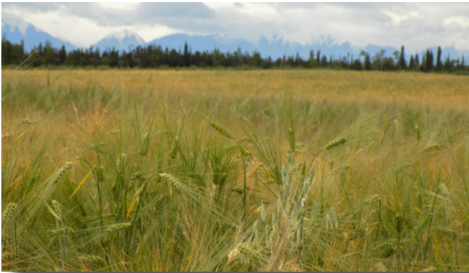
Acres of barley are grown in Delta Junction, Alaska.

The Barley Crop Insurance program is a yield protection program and is available in Fairbanks North Star, Matanuska-Susitna, Southeast Fairbanks, and the Valdez-Cordova boroughs. You can choose to insure a percentage of your approved average yield, from 50 percent to 75 percent. The price election is the price you receive if you suffer a loss.